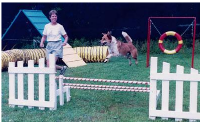
Kitty in 2010 with Browser

At press time, the plans for the Spirit of Agility award include its inaugural presentation at the CATS September CPE Trial.